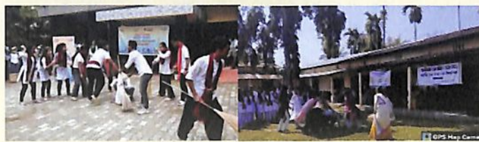
Students performing Street Play