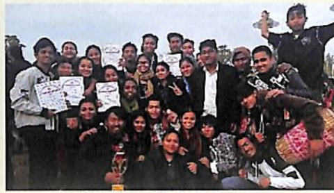
Modern Song (Group) 1 ST Position

Dibrugarh University Inter College Youth Festival, 2023-24