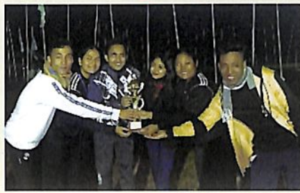
Mime - 1 ST Position