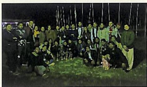
2nd Best Runners-up Team