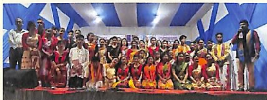
Best Team (Folk Dance & Folk Music) Assam Book Fair, Tinsukia